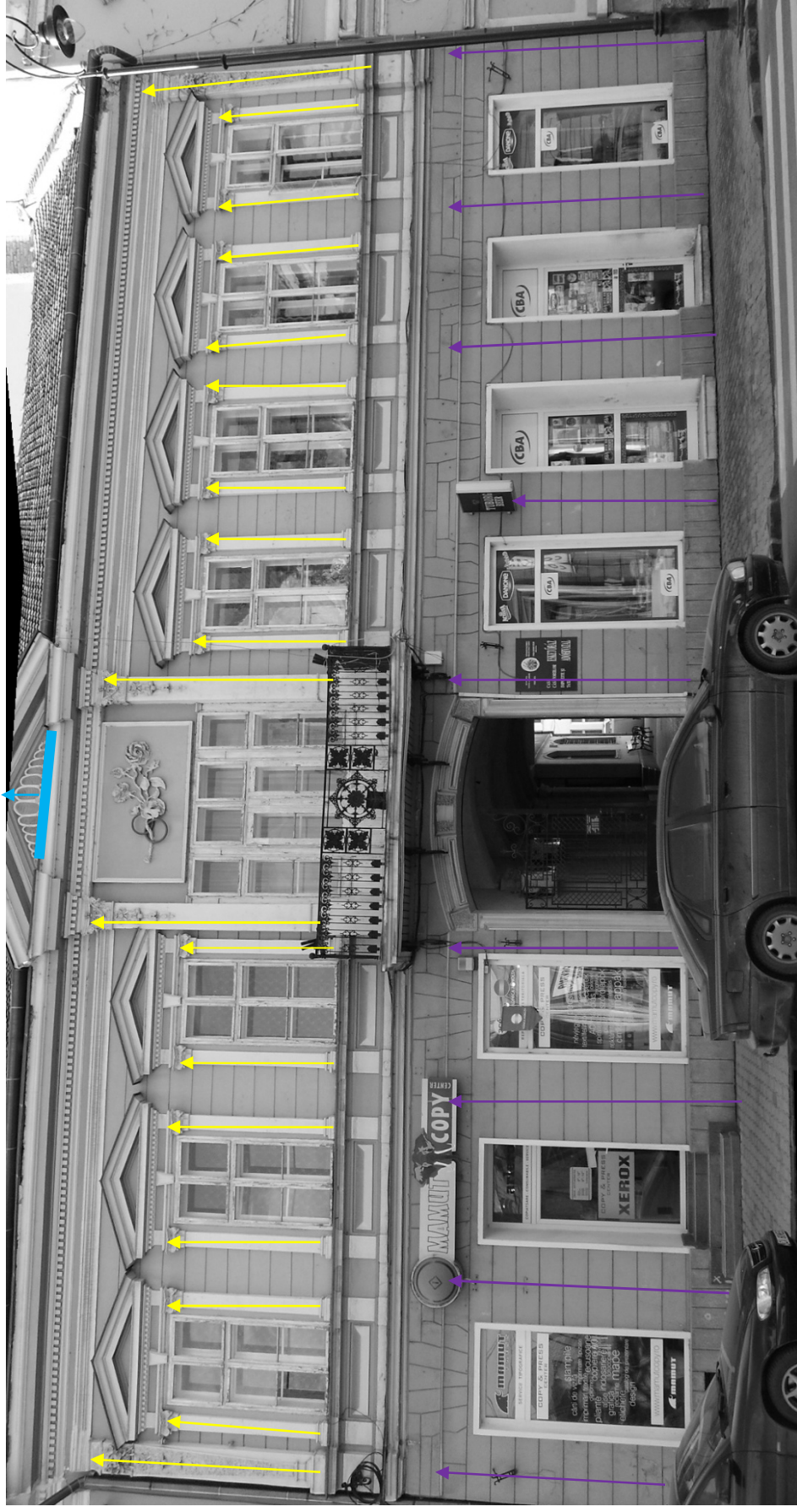
Cladire 1/1 sala festiva