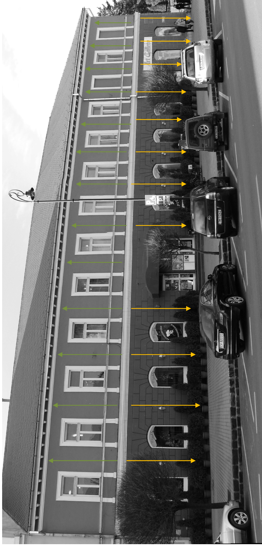
Cladire 1/3 birouri